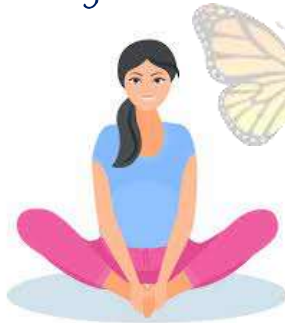
Butterfly Pose Badhakonasana