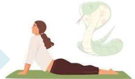
Cobra Pose Bhujangasana

Cobra Pose can boost energy, fight fatigue, and build confidence. It improves posture and counteracts the effects of prolonged sitting and computer work.