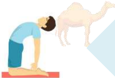
Camel Pose Ustrasana